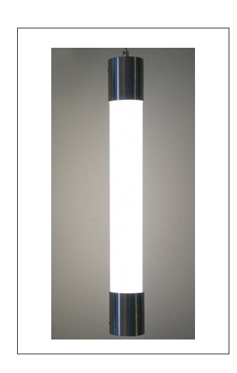
RAD-A WITH BOTTOM CAP

Electronic manufacturer's extended 5 year limited